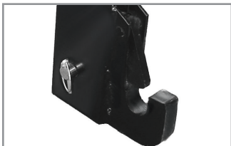
LOWER ARMS LOCK AUTOMATICALLY