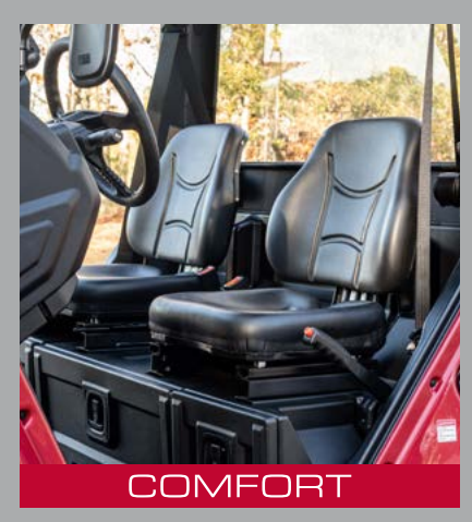
Built to provide ample space for its passengers, our seats come equipped with adjustable slide, tilt, and lumbar support.