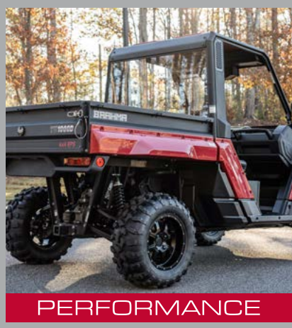
The BRAHMA boasts an impressive 1000lb. cargo bed load capacity and 2000lbs. of tow capacity for when power is paramount.