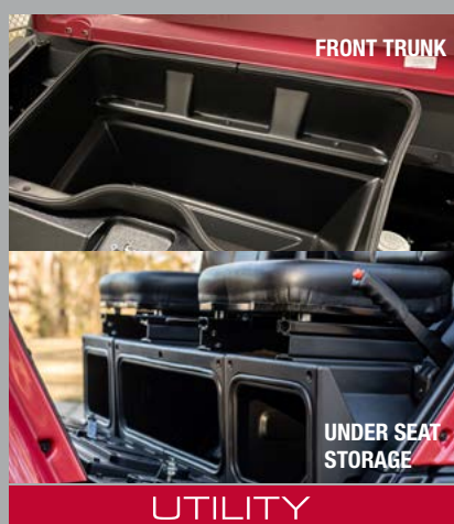
Comes with ample storage space for use in storing everything from tool boxes to hunting gear, including front and lockable, under-seat storage options.