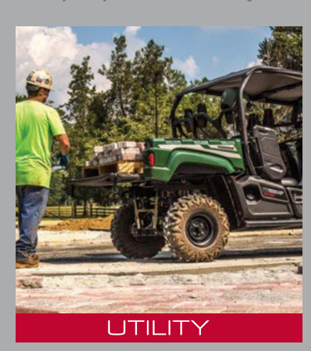
Your YANMAR UTV was meticulously engineered to meet every requirement you have of a jobsite machine. The flatbed dimensions fit a standard pallet, and an impressive 1,500 lb. towing ability with a full payload keep your machine ready for any challenge.