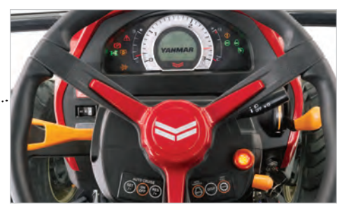
Full LCD display with electronic controls