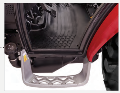
Flat, walk-through floor and large, anti-slip step