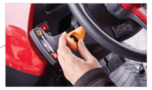
Fingertip forward/reverse control